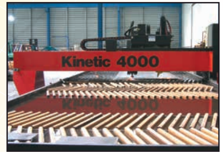
Plasma Cutting & Drilling