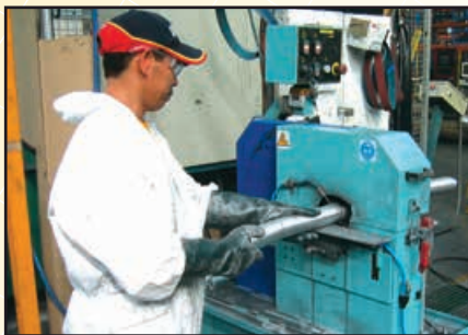
Finishing / Sanding